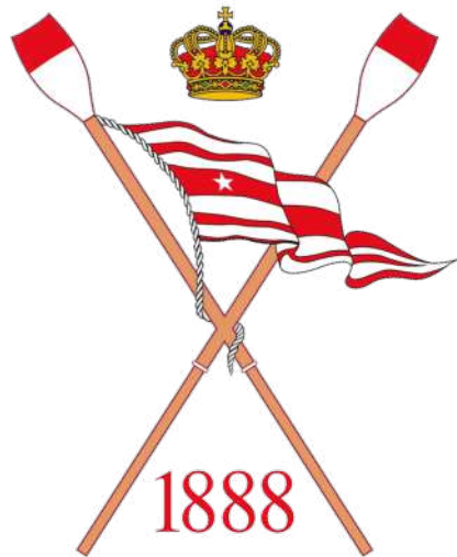
Société Nautique de Monaco